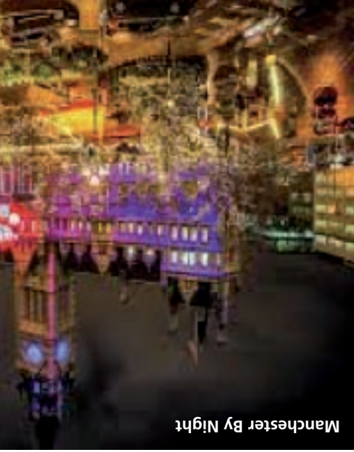
Manchester Town Hall

Located right in the centre of the city, this iconic Victorian-era building is a must see as the architecture is stunning both inside and out. You can join a guided tour of the whole building or just wander through the ground floor corridors by yourself