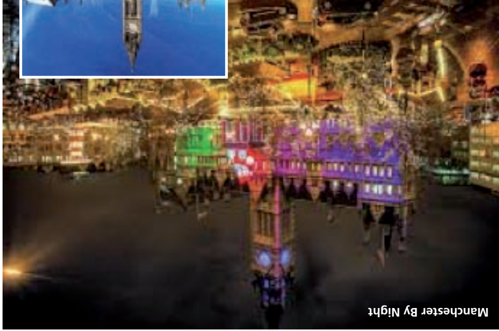
Manchester By Night